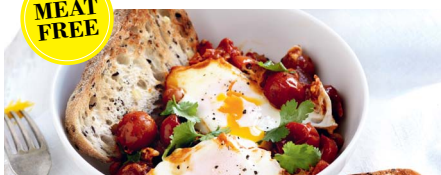
Moroccan spiced eggs healthyfood.com 1740kJ (416cal)