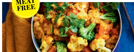
Lentil and kumara korma curry healthyfood.com 1600kJ (382cal)