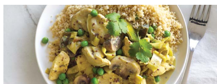
Creamy mustard and leek chicken with wholemeal couscous healthyfood.com 1710kJ (410cal)