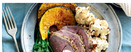
Roasted lamb with pumpkin and dukkah healthyfood.com 1680kJ (401cal)